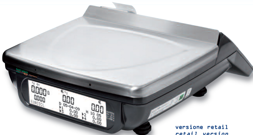
versione retail retail version