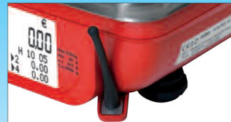
Radio frequenza wireless